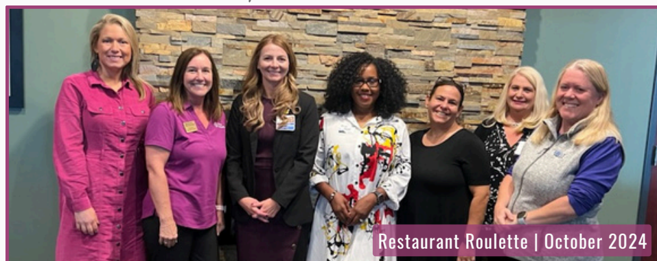
Restaurant Roulette | October 2024