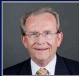
Mayor Herb Roach City of O'Fallon