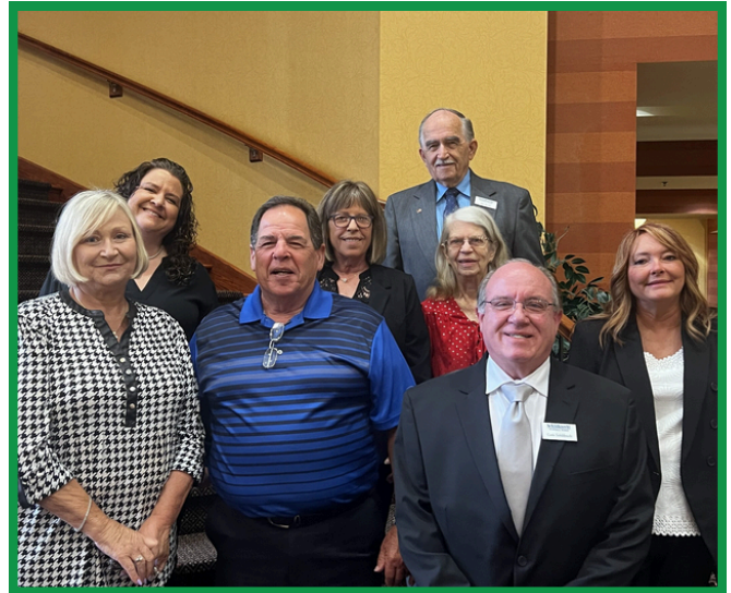
Heritage Award | Schildknecht Funeral Home