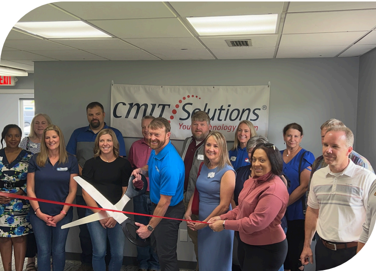
CMIT Solutions Metro East St. Louis 1402 Frontage Rd, O'Fallon, IL 62269