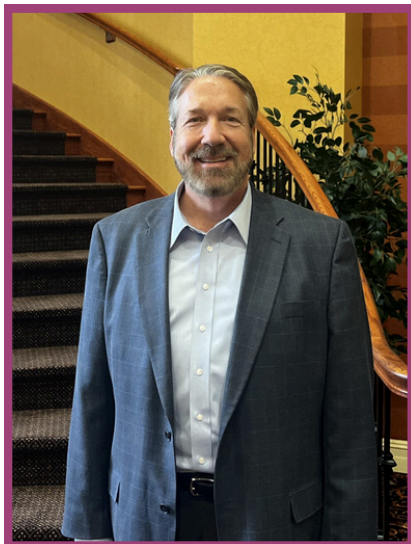
Economic Impact | Beltone Alliance