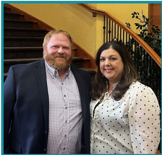
Transformation Award | Boarding House Bistro