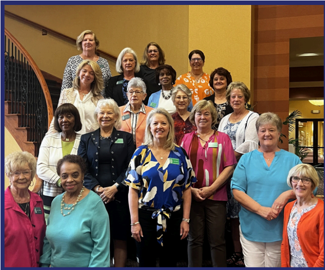
Rotary Community Service Award | O'Fallon Woman's Club