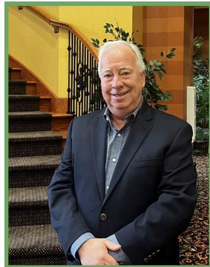
Transformation Award | Aufferberg Dealer Group